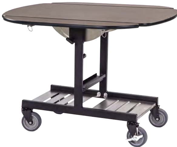
Room Service Table (#74420)