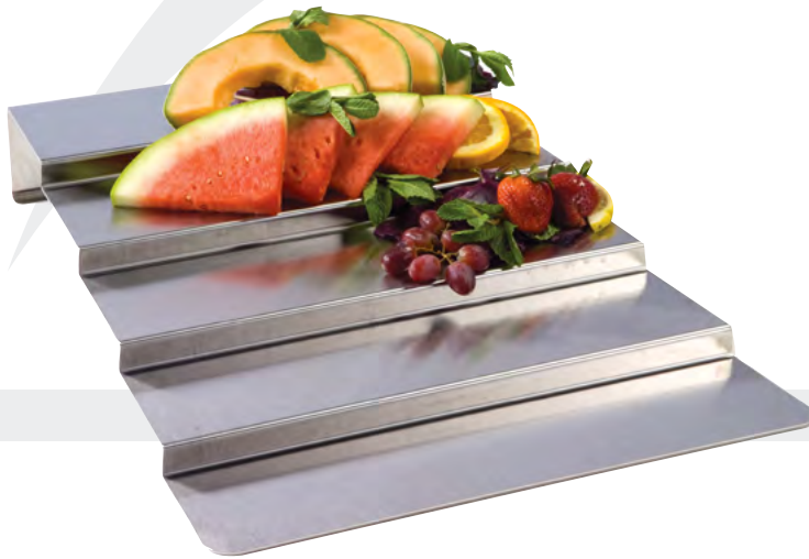
Display Riser (#200)