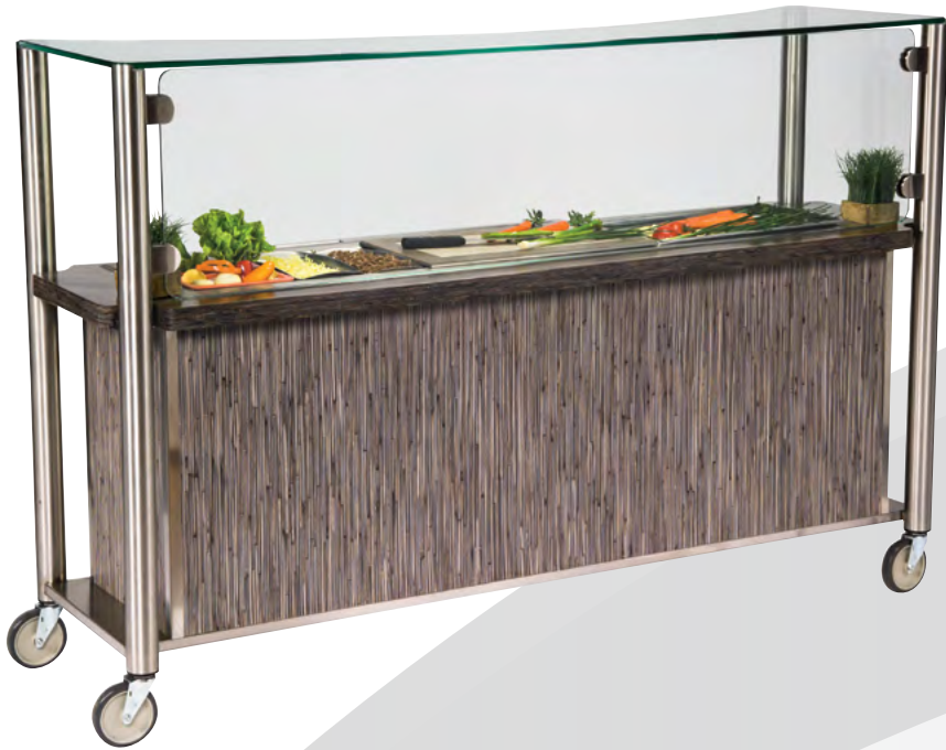
Action Station (#79502)