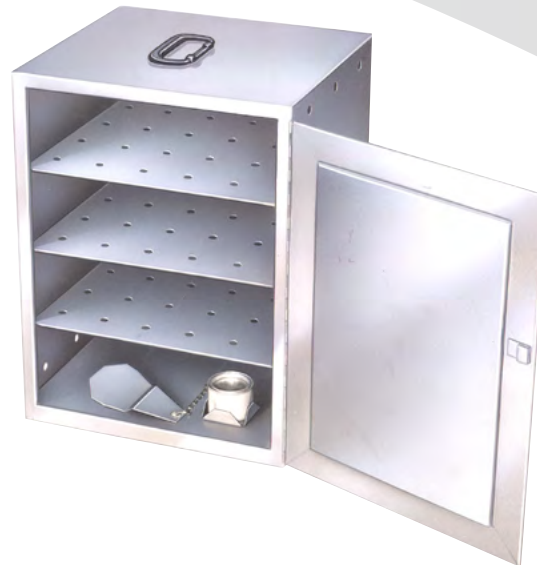
Food Carrier Boxes (#75112 & #75113)