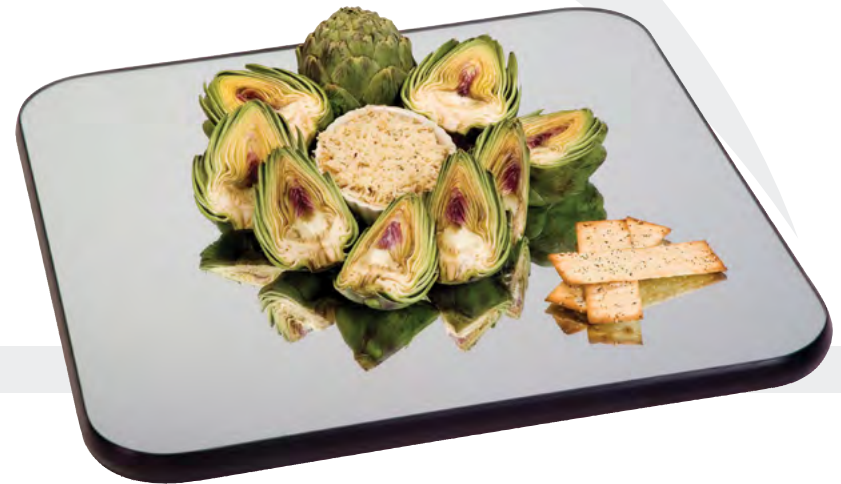
Display Tray (#260)