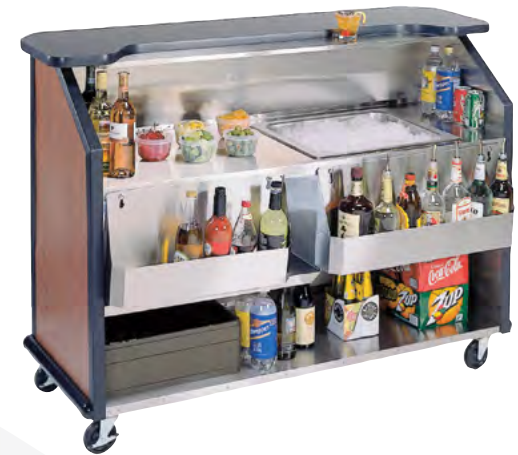
Portable Beverage Bar (#76887)