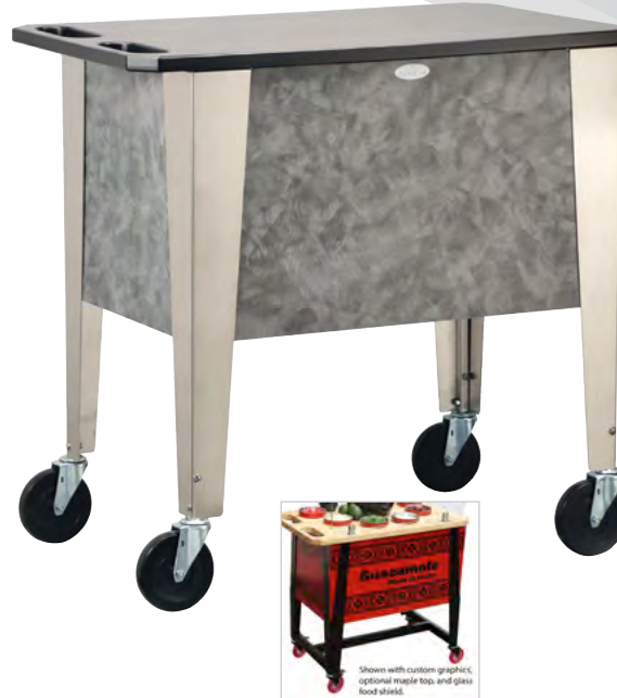
Tableside Guacamole (#39105)