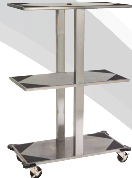
Racks (#74550 & #74555)