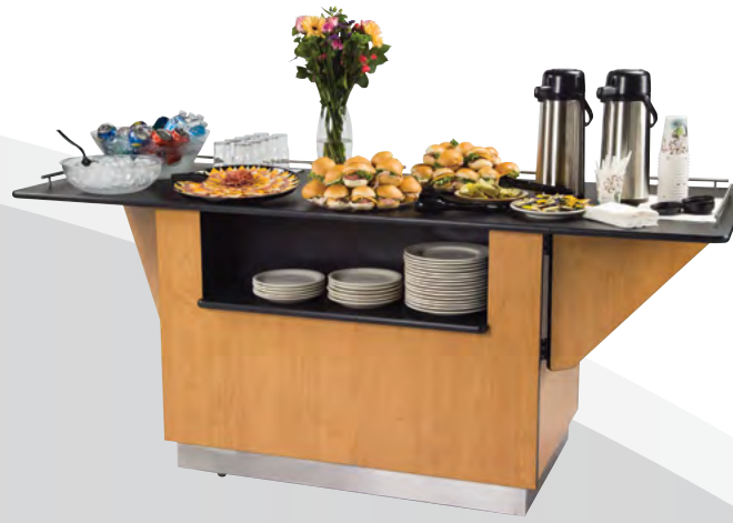
Breakout Dining Station (#79685)