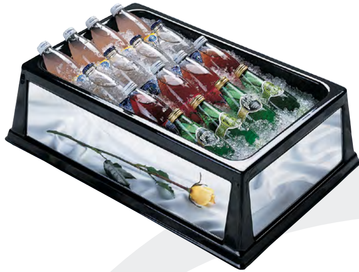
Beverage Bins (#297)