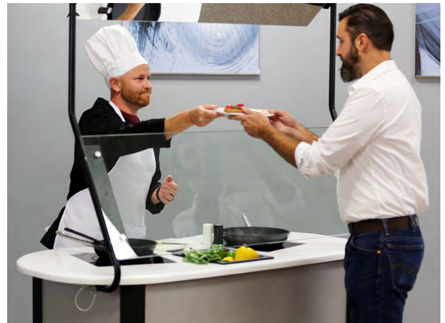
Creation Station® (#63070)