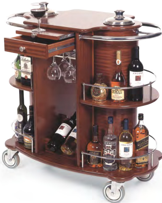
Liquor & Wine (#70260)