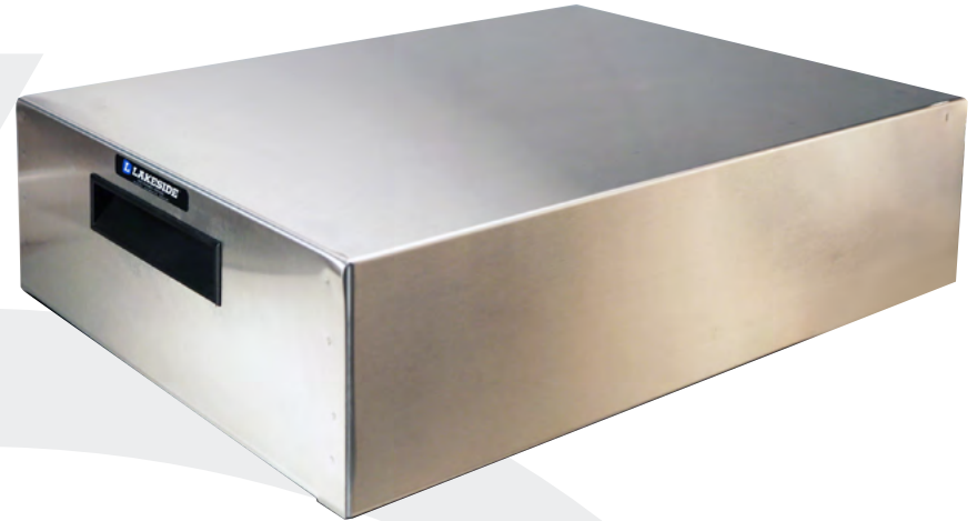
Cutting Board Riser (#79555)