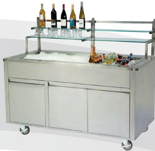
Back Bar (#79863)